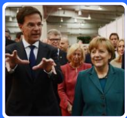
HANNOVER MESSE 2014