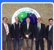
PakTurk Help Pakistani Auto part Exporters