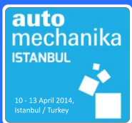
Automechanika Istanbul 2014