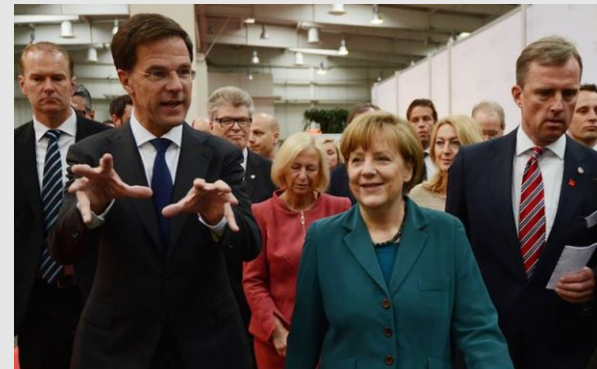
Netherlands Prime Minister Mark Rutten with German Chancellor Dr. Angela Merkel, HANNOVER MESSE

For the Pakistani exhibitors, this was historic entry as the Netherlands Prime Minister Mark Rutten opened jointly with German Chancellor Dr. Angela Merkel, HANNOVER MESSE. The head of government of the Netherlands also performed the common and traditional tour of the exhibition with the Chancellor and opened a meeting of top industrialists of both countries. In his greeting to the fair, the Dutch prime